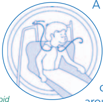
Avoid strangulation hazards

A protrusion hazard is a component or piece of hardware that is capable of impaling or cutting a child, if a child should fall against the hazard.