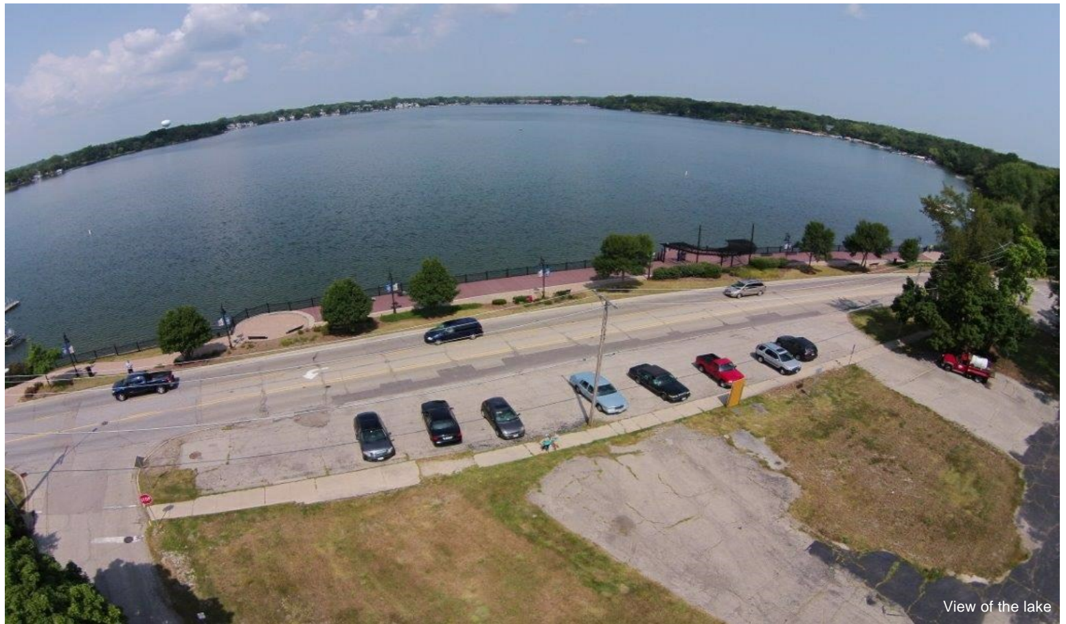
View of the lake